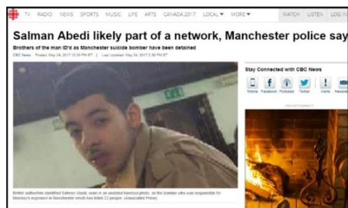
May 24, 2017: CBC.ca's description of the perpetrator of the Manchester Arena attack