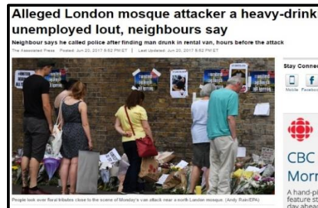
June 20, 2017: CBC.ca's description of the perpetrator of the Finsbury Park Mosque attack